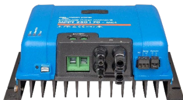
SmartSolar Charge Controller MPPT 250/70-MC4 without display