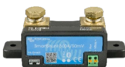
Bluetooth sensing: SmartShunt